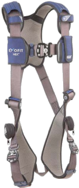
Model 1113004 Shown (Front)