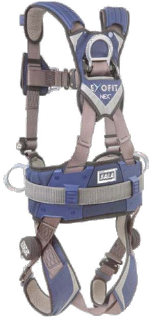
Model 1113121 Shown (Back)